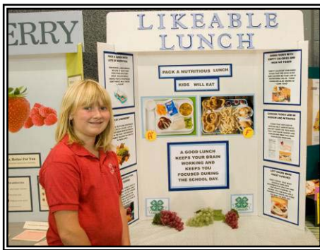
1 st Place Junior Display

Agriculture and Agri-Food Canada Growing Forward Grants supplied prizes for the top 10 winners in the Junior and Senior categories in the form of Future Shop gift certificates: 1 st place $400, 2 nd place $250, 3 rd place $150 and 4 th to 10 th places $75 each.