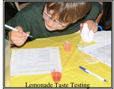
Lemonade Taste Testing

Fifty-four 4-H members from around the province participated in the 2010 4-H Good Food Lunch Educational Display Program at the PNE August 22 to 25. The educational displays were created on the topic, “Good Food Lunch – good to eat, good for kids, good for B.C. farmers”. As well as the educational display contest, members participated in a seminar about innovation and product development. The seminar was about new product development of lemonade, including taste testing, value adding, marketing a lemonade stand and playing a simulated computer game.