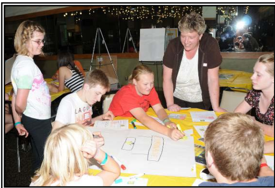
Lemonade Stand Marketing Activity

Thank you to our judges, volunteers, presenters and photographer for helping us run a successful program. We would also like to thank the generous sponsors who helped make this program possible: Agriculture and Agri-Food Canada Growing Forward Program, the PNE, BC Ministry of Agriculture and Lands, and B.C. 4-H.